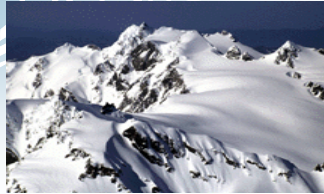
Baby, it's cold outside!

What those “Winter Storm Warnings” really mean, and how to effectively prepare for them: